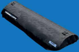
EMILY Small USV