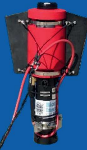
XRR Microradiometer Array

Unmatched in dynamic range, sensitivity, capability, and durability in harsh environments.