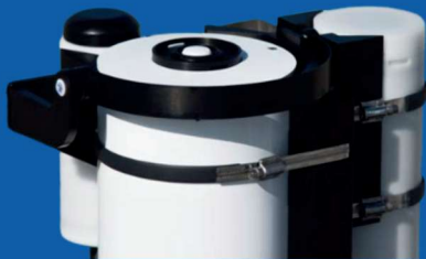
GUV Ground Station