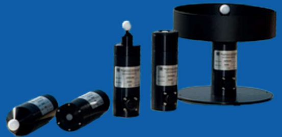
Q-Series PAR Sensors