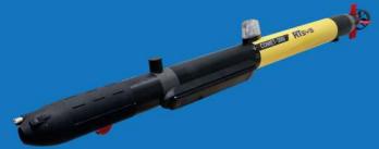
COMET 300 Autonomous UUV