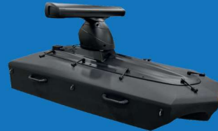
RECKLESS Large General Purpose USV