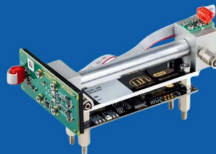
NDIR Gas Sensors