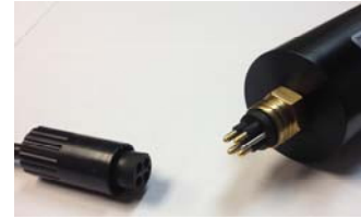
Fig4. QSC-2145 Accessory cable for QSPL-2150. Lengths up to 200 meters are

Fig3. QSPL-2150 shown with MCBH-4-MP connector and mating plug.