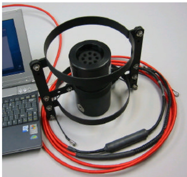
This 4-channel radiometer is fully powered by the host PC's comport

Having very low power requirements ( >2\text{mA} / channel), the BIR is suitable for solar and/or battery-powered moorings. The BIR may also be backpacked into remote locations for use in shallow ponds or mountain streams.